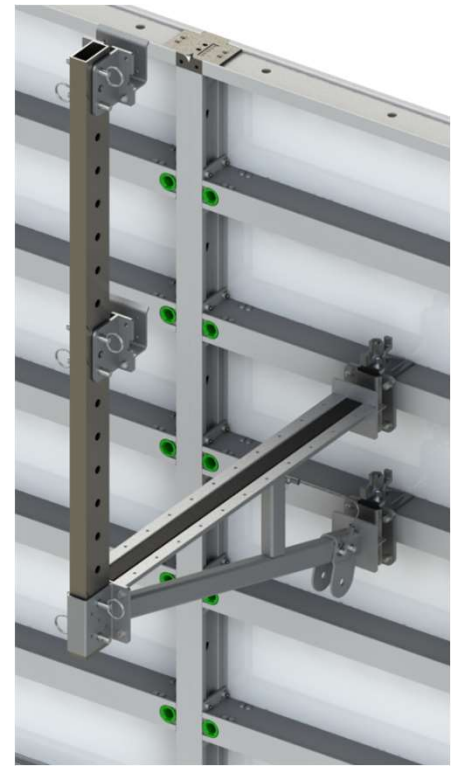
Figure 1. Walkway Bracket With Alignment Bar Guardrail Post Assembly

Note: all components must be inspected for cracks, broken welds or any other visible defects prior to each use. Replace all components that are deemed to be unsafe for use.